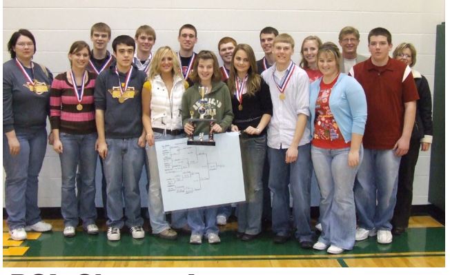
PCL Champs! - Congratulations to the Kalida High School Academic Club for winning the PCL Academic Tournament Championship on March 18.

Report underage drinking to local law enforcement. Remember these facts during the upcoming prom and graduation parties and events.